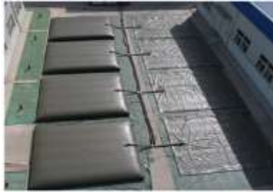
Fig. 3 Soft Tanks

Horizontal steel tanks (HST) are intended for stationary storage of liquids - water, oil, petroleum products, as well as technological mixtures and other liquids with a density of up to 1.3 \text{ t / m}^3 .